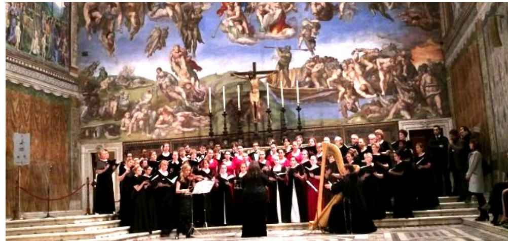
And right next door