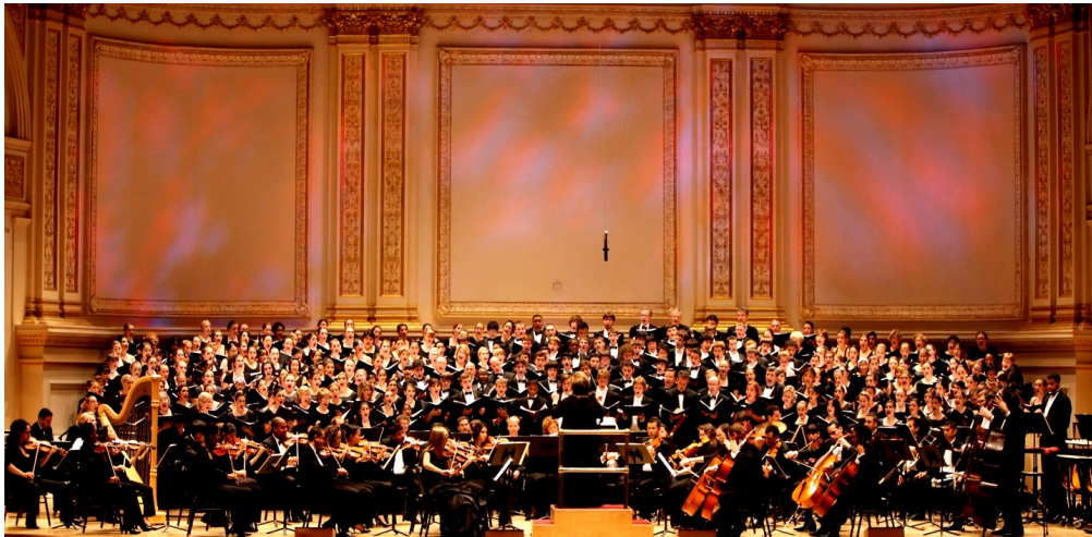
Around the World